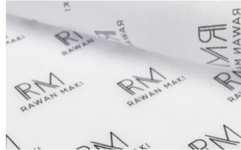
17g Tissue Paper

For something more premium, we offer weights of 34g and 40g.