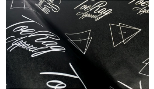
40g Tissue Paper