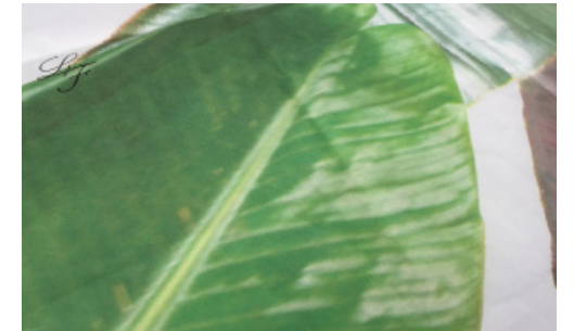
4 Colour Process (CMYK)