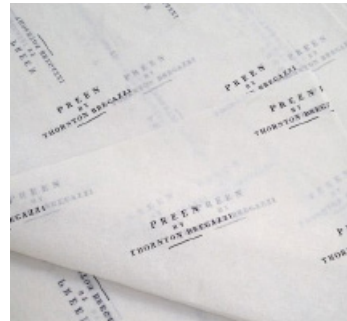
Cut to sheets

Tissue paper can either be supplied on a continuous roll or cut to size.